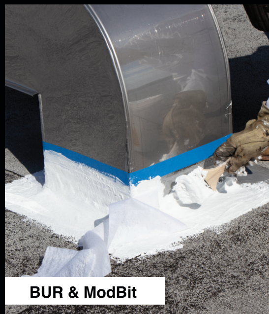
BUR & ModBit