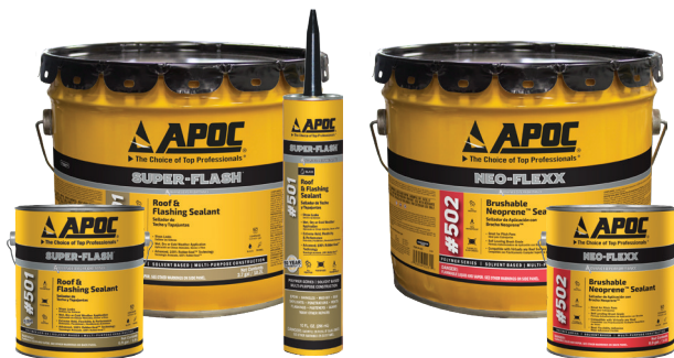
APOC® 501 TROWEL GRADE